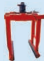
BRICK BLOCK CLAMP