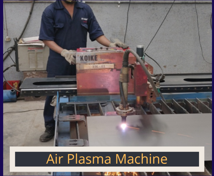
Air Plasma Machine