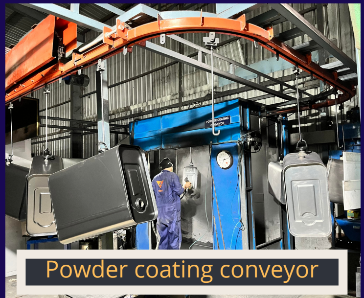
Powder coating conveyor